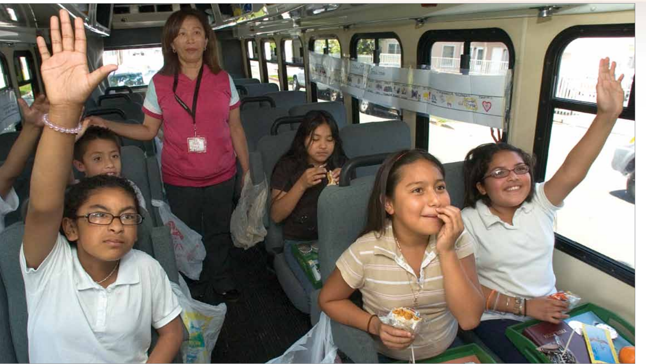
Children at Garfield Elementary School raise their hands to answer Bible questions during RTCE class. Classes are held off of school property to comply with state laws.