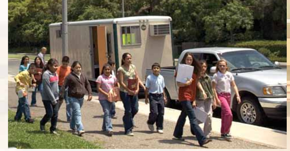
Students at Greenville Elementary School walk to one of three mobile Released Time Christian Education (RTCE) classrooms, where God's Word is taught.