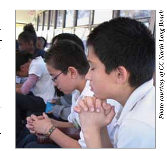
A student prays at a RTCE class conducted by CC North Long Beach.

As a sower who casts the seed, many of the teachers do not know if their lessons will bring forth fruit, some thirtyfold, some sixty, and some a hundred (Mark 4:20), but they are faithful to proclaim God's Word to students each week. One child within the Long Beach program gave his life to Christ